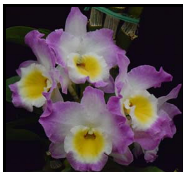
2 nd Place Intermediate Den. Angel Moon 'Love Letter' Owner: Duncan Chun