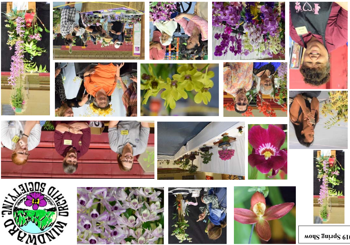
2019 Spring Show