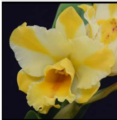
1 st Place Intermediate Blc. Destiny 'Dixon' Owner: Al Lindo