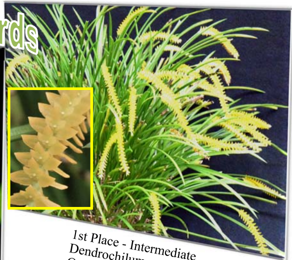
1st Place - Intermediate Dendrochilum wenzelii Owner: Duncan Chun