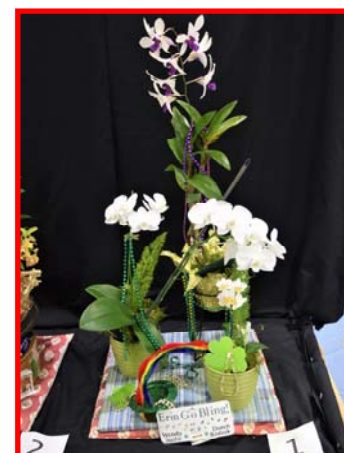
2018 Spring Show Table Top Display

Ribbons to be awarded: 1 st Place, 2 nd Place, 3 rd Place, 4 th Place, 5 th Place and a Judge's Choice.