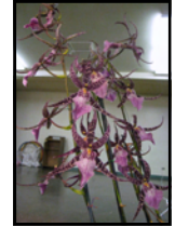
Gram. scriptum 'citrinum' Owner: Elise Swope