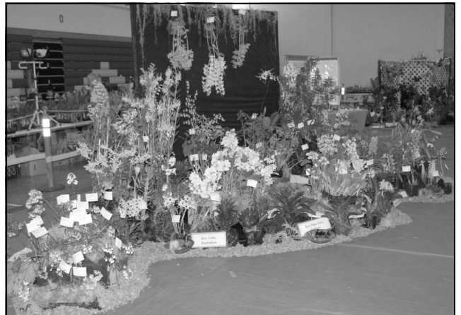
Honolulu Orchid Society, Inc.