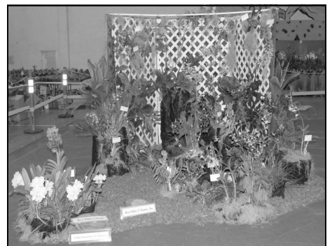
Ewa Orchid Society