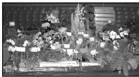
Orchid Society of Manoa