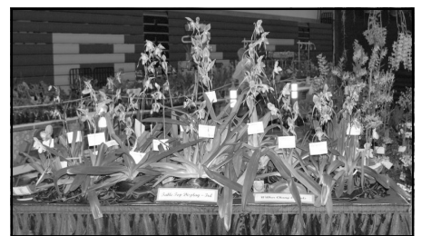
Wilbur Chang Orchids