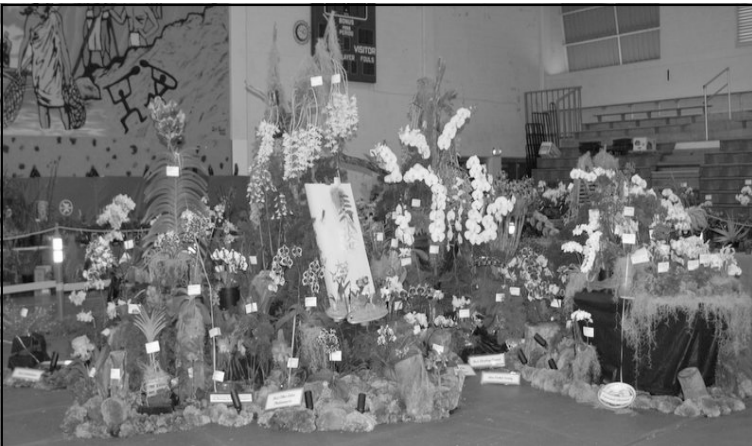
Aiea Orchid Club