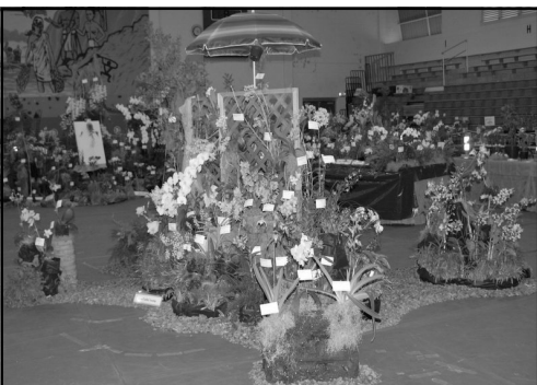
Hui Okika O Kunia