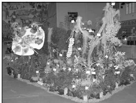
Hawaii Kai Orchid Society