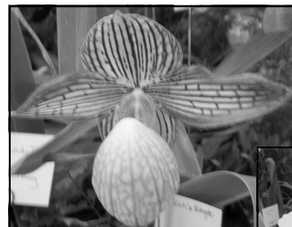
Paph. Gloria Naugle