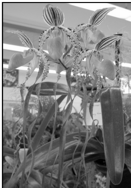
Paph. Michael Koopowitz