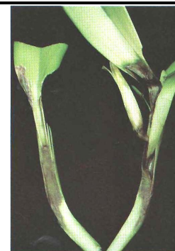
Longitudinal sections of dendrobium shoot showing internal rot.

Intermittent wet periods allow the fungus, Phytophthora, to grow, sporulate, spread and infect, although serious disease symptoms may not develop until the next period of extended high moisture. Reduction of high humidity and avoidance of excess water are essential to disease control and can be attained by having solid covered greenhouses or glass houses, good ventilation and well drained potting media. Fungicides are effective against Phytophthora and should be used in conjunction with sanitation and moisture control practices for reducing Phytophthora blights. Sanitation procedures, such as the removal of dead and diseased plant parts, greatly reduce fungus spore levels and will increase the effectiveness of fungicides. Glass, plastic, cloth or other nonmetallic tools, pots and equipment can be disinfested with a solution of 10% household bleach. Slugs and snails are potential agents for this spread by carrying spores on their bodies or by ingesting spores and later excreting viable spores.