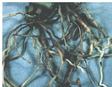
Dendrobium root rot.