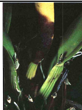
Leaf necrosis and pseudobulb rot originating at the base.