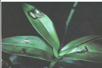
Sunken, dark lesions on dendrobium cane.