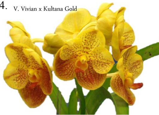
4. V. Vivian x Kultana Gold