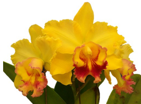
2. Blc. Beverly Blietz 'Karen' AM/AOS/HOS