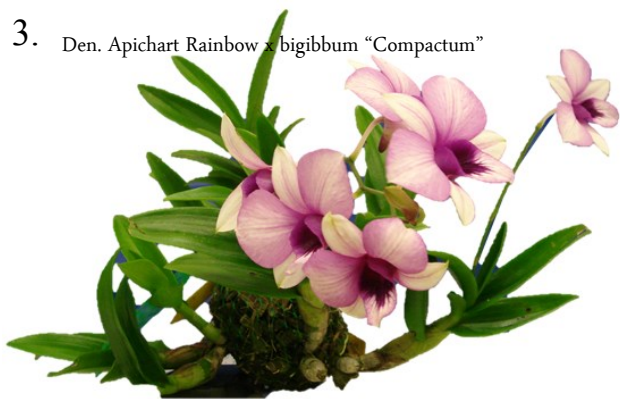
3. Den. Apichart Rainbow x bigibbum "Compactum"