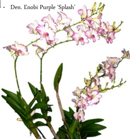
1. Den. Enobi Purple 'Splash'